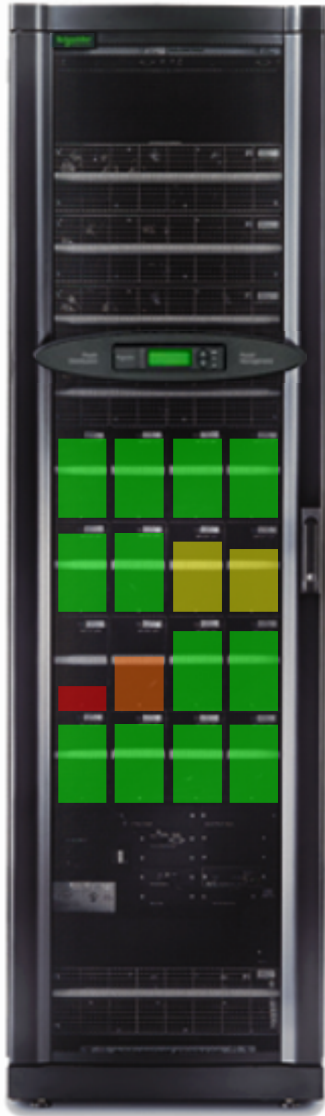
Battery Health Visualization